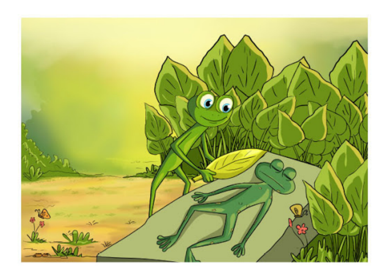
"Mother, I am here! I brought medicine for you!"